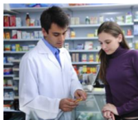
Patient Group Direction