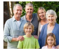
Mental Capacity Act