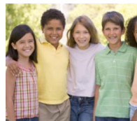
Safeguarding Level 2