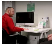
MECC Video critique