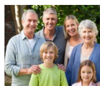
Mental Capacity Act