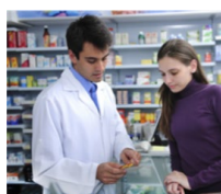
Patient Group Direction