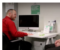
MECC Video critique