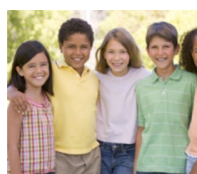
Safeguarding Level 2